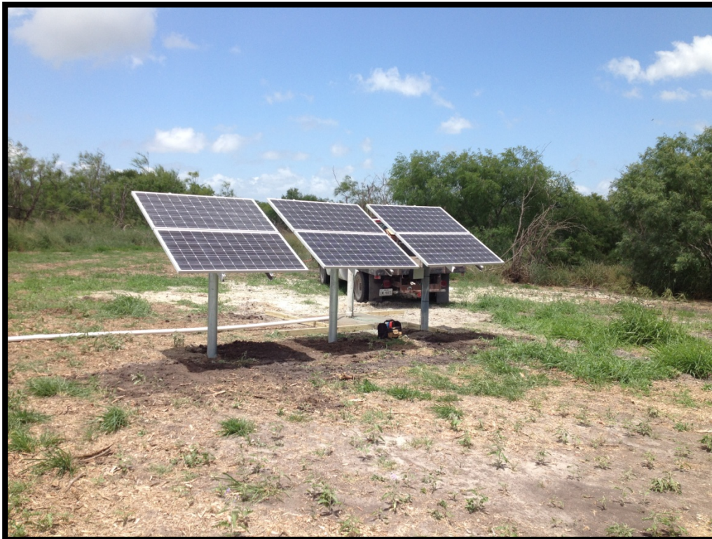
Project 1428 : Solar Panels for the Freshwater well