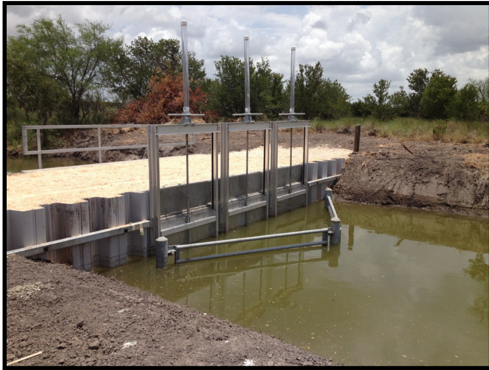
Project 1217 : The finished FWCS on the Rincon Bayou