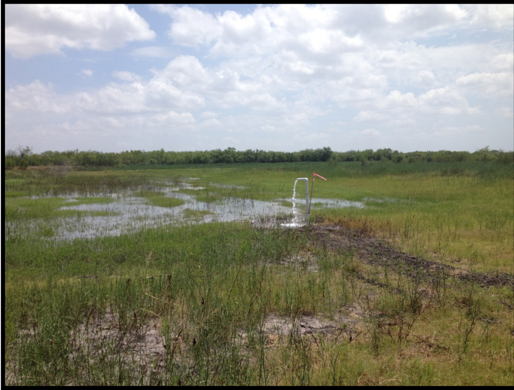
Constructed wetland with 60 gpm flowing from solar well