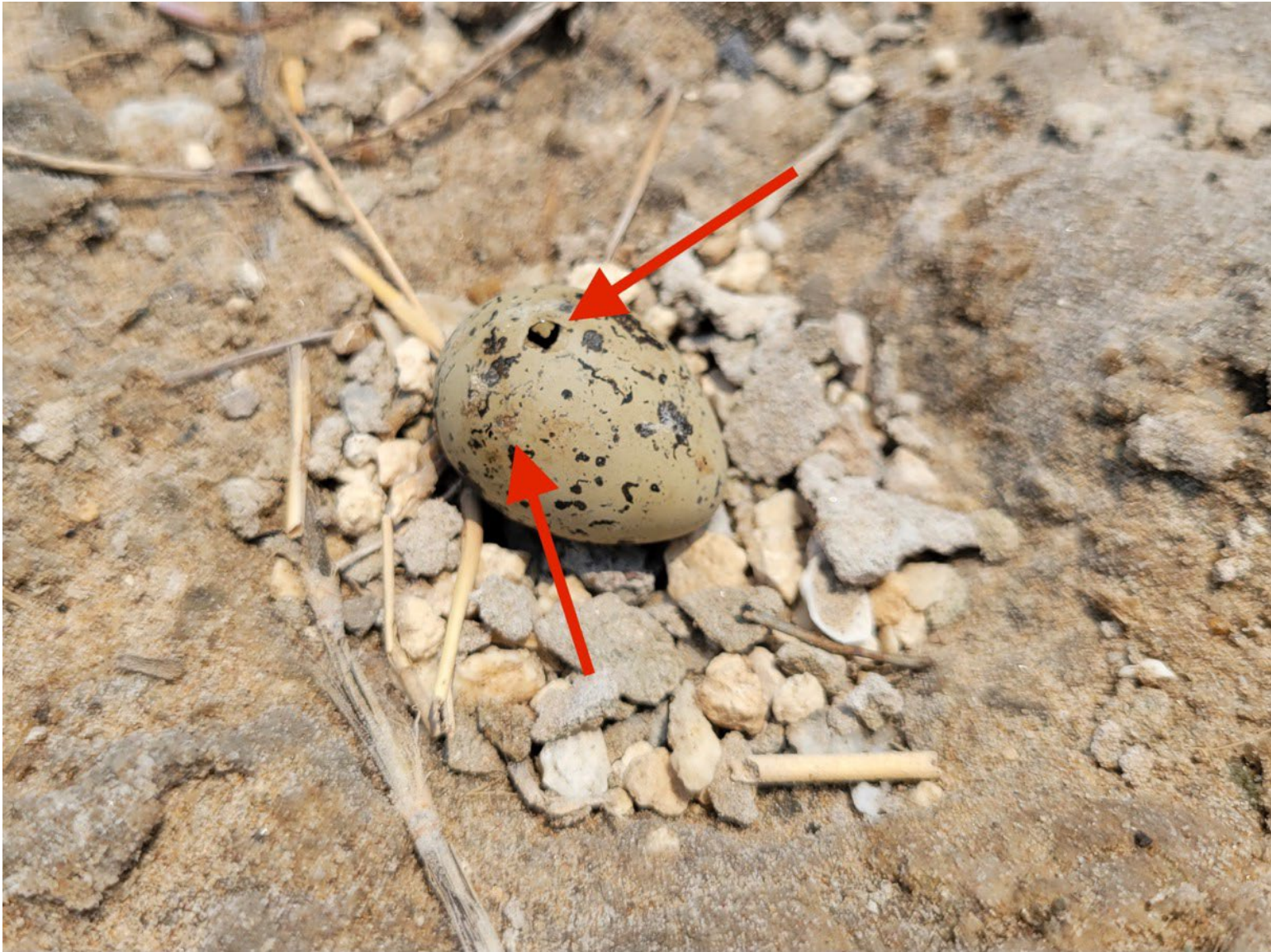
Figure 5. SNPL 2 close up photograph with arrows showing damage on single egg on June 6, 2024.