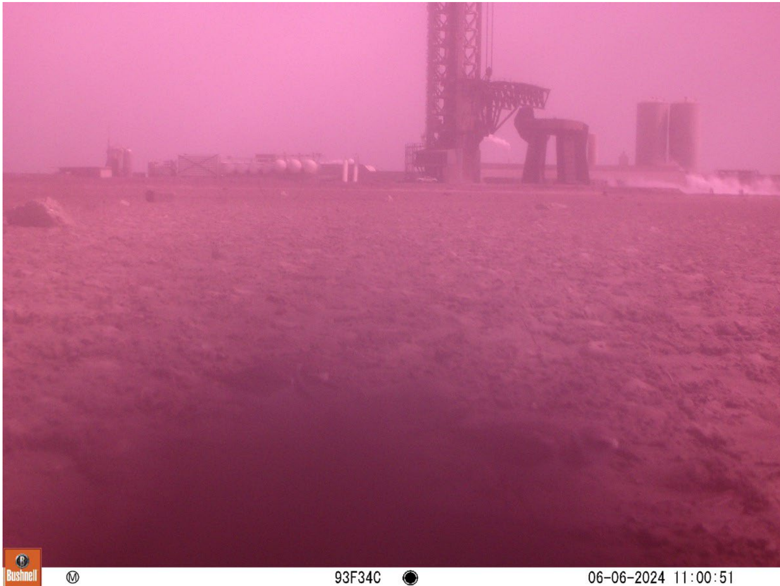
Figure 19. WIPL 1 game camera showing both WIPL adults in attendance but nest cup not quite visible due to pebble lodged in camera lens and overall pinkish hue post-launch on June 6, 2024.