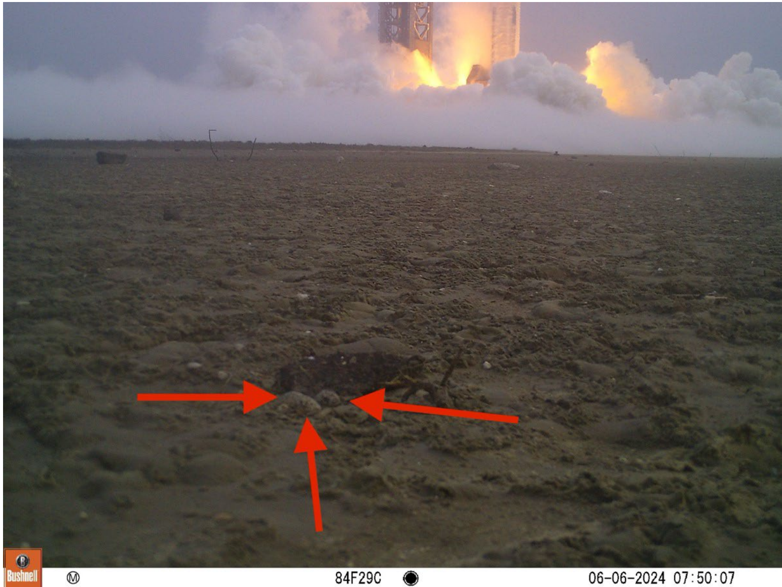
Figure 17. WIPL 1 game camera showing 3 eggs in nest cup with rocket engines firing in the background on June 6, 2024.