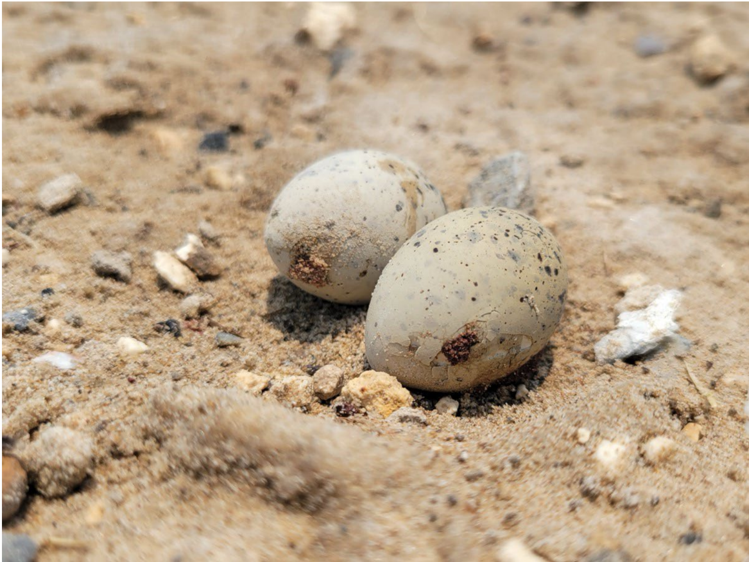
Figure 9. LETE 1 showing both eggs with large holes/cracks and dried egg contents emerging on June 6, 2024.